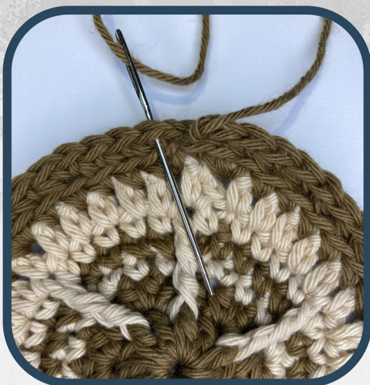
invisible join step 1.

Finish off with an invisible join and weave in ends.